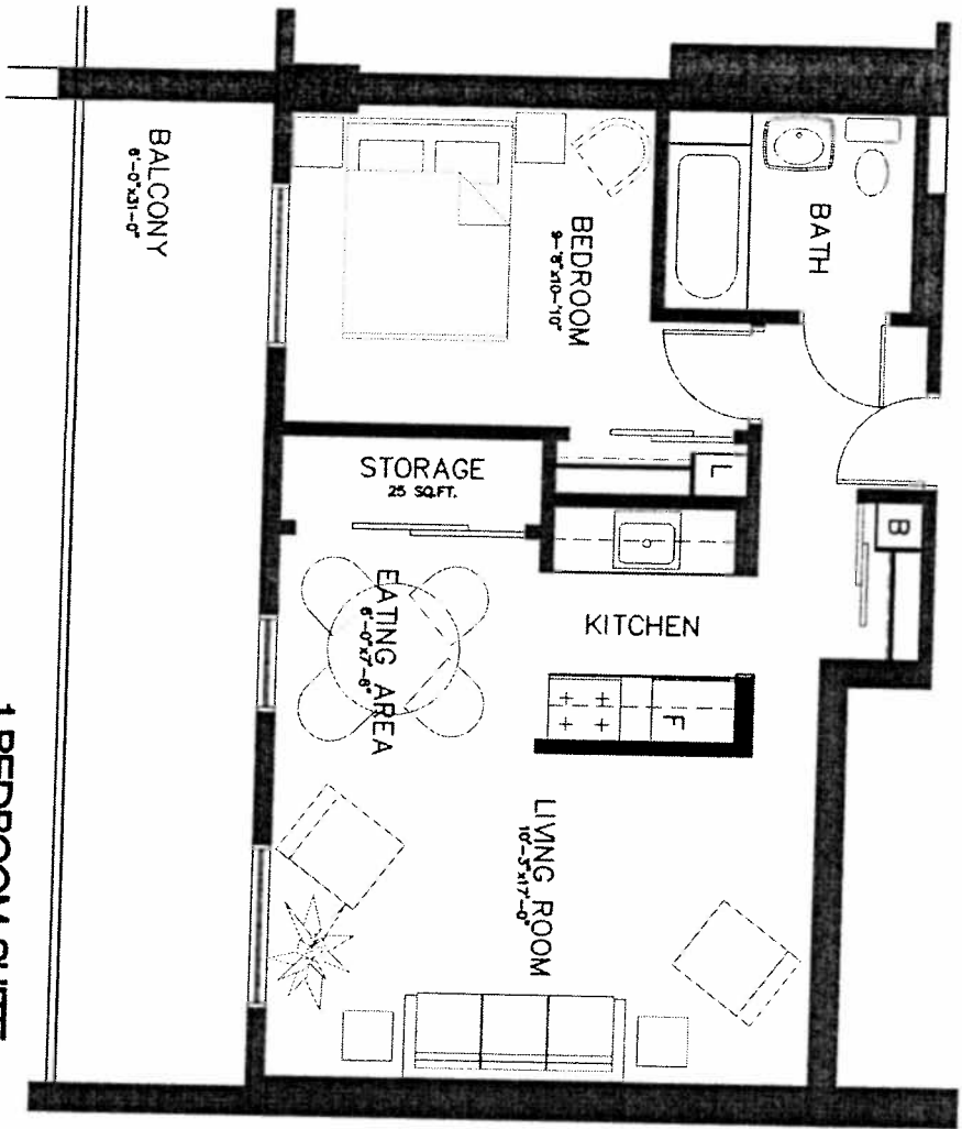
1 BEDROOM SUITE TYPE 'C'